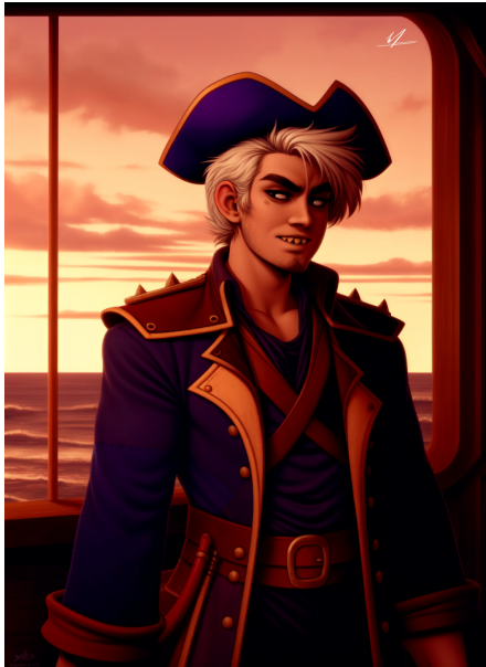
Captain Black gun