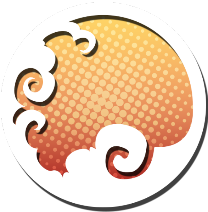
Captain Black Gun