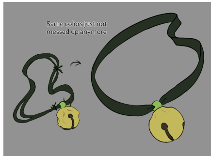
Tag update for Round 2