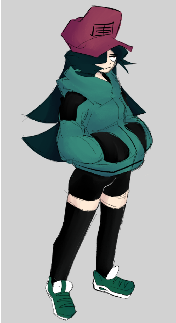
[Older Refrence Image]