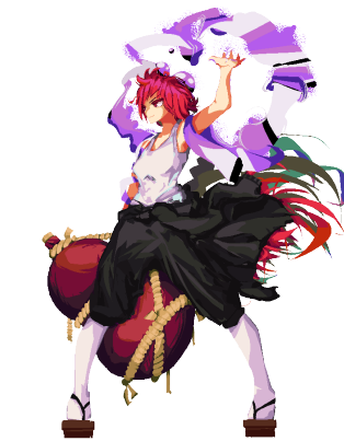
Daoyi in alternative medium