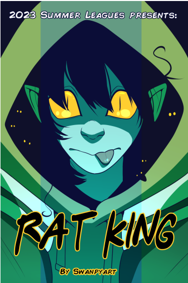
Rat King's Audition Cover