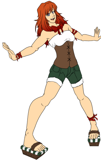
Full Body Reference (No Hood- Artist is Dalmatia#8337)