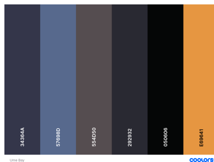
Ume Bay Palette