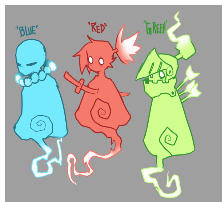
Blue, Red, and Green (duh)