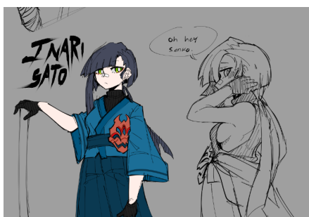
Concept Art 1