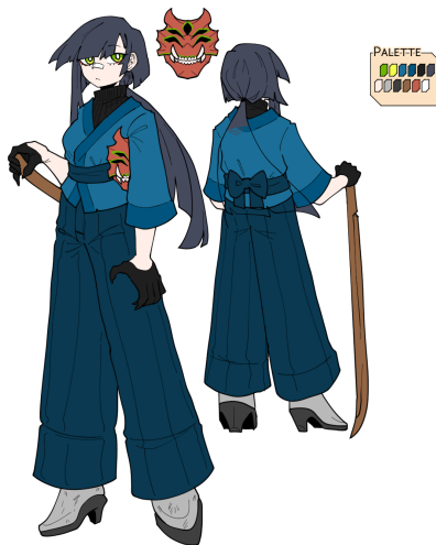
Full body + Turn Around