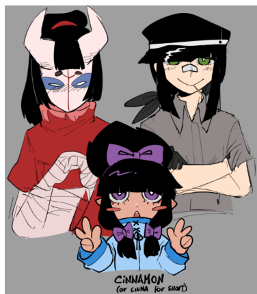
Inari, Senko and Cinnamon.