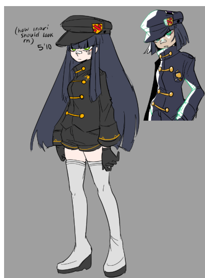
Classic Uniform Look + Young Inari