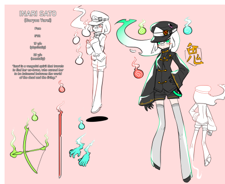
Past Inari Refsheet