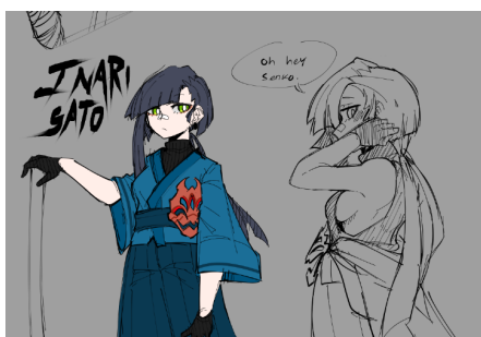
Concept Art 1