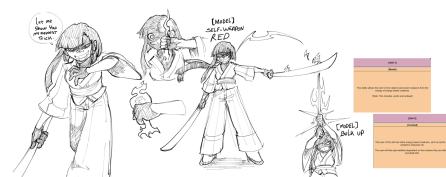
Concept Art 2