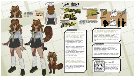
Full Reference Sheet